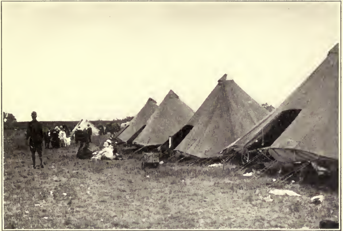
COMPANY STREET AT FRAMINGHAM